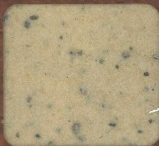
VP - 516