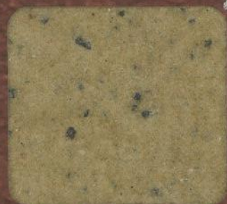
VP - 514