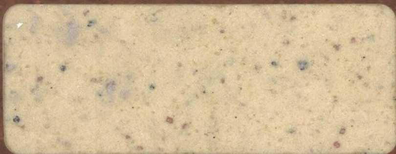
VP - 521