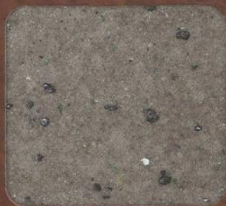
VP - 515