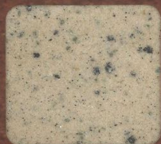
VP - 522