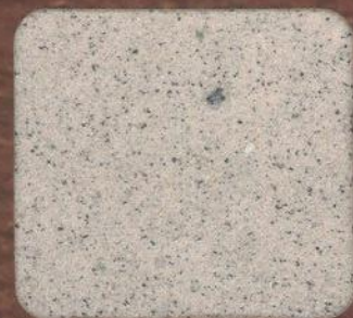
VP - 517