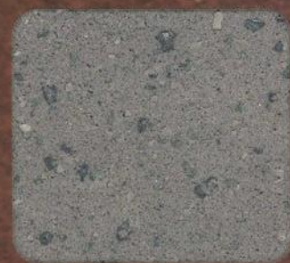
VP - 520