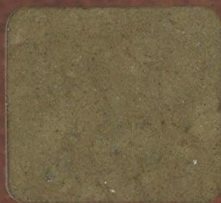
VP - 518