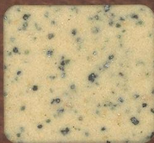
VP - 519